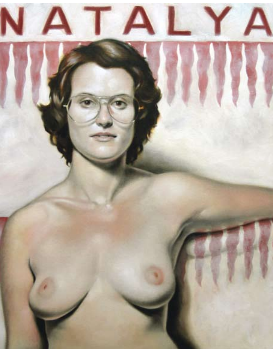
UNTITLED, OIL ON CANVAS, 30 X 24"