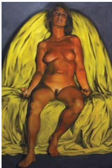
NIGHT, OIL ON CANVAS, 60 X 40"