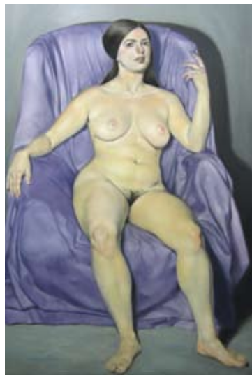
DAY, OIL ON CANVAS, 60 X 40"